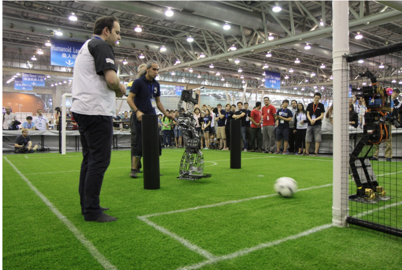
Fig. 2. Refereeing Duty during HL Game.

play evolves. By that time it would be desirable to have an automated referee assistant system to help judging the proposed rules.