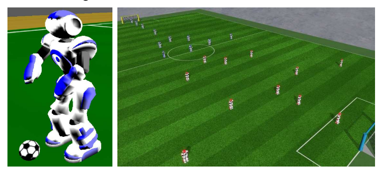
Figure 1. On the left is a screenshot of the Nao agent, and on the right a view of the soccer field during a 11 versus 11 game.