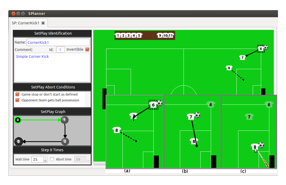
Fig. 1 - Setplay definition tool - SPlanner - and example of Setplay steps (bottom).

Figure 2 presents an example of the XML-like specification file that represents the sequences of actions, graphically designed with the SPlanner tool. In order to anyone interested to integrate the setplay capability to its team, the following steps should be taken: