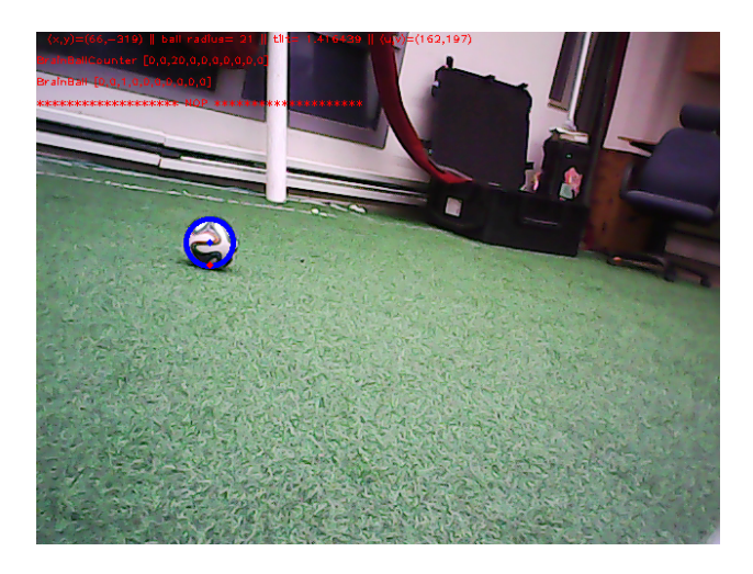
Figure 2: The robot detects the ball

The ball detection algorithm is based on finding circle shapes in a B&W image. Assuming light conditions are very noisy and therefore unexpected, as well as the colors of the ball are unknown, we have tried to develop an algorithm that is based on the geometry of the object and not on the objects color. We use OpenCV's Hough transform functions, in particular Hough-Circles, to detect circular objects. In addition, we ensure that the founded circular object is located on a green background, in order to eliminate circular objects positioned outside the field. We also take into consideration the fact that the ball is 50% white. We color in white the other 50% non-white pixels (which are inside the ball boundaries) by applying Erosion&Dilation to the B&W image. By doing it we get a perfect circle, which is easier to detect. A ball detection example is presented in figure 2