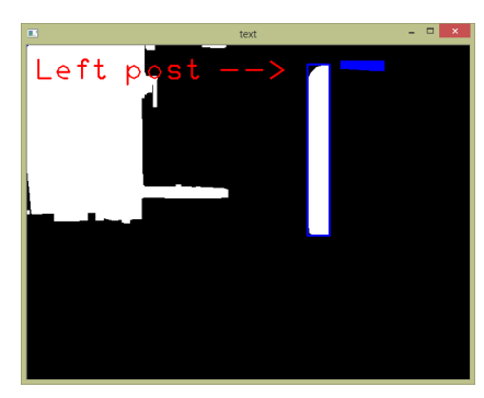
(b) The crossbar is detected (colored in blue), and the algorithm detects that the post in the image is the left post.