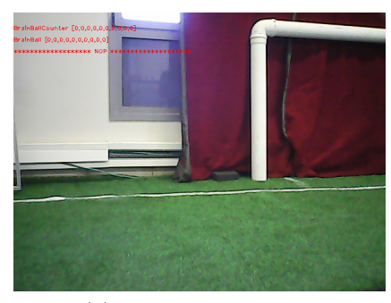
(a) The original image

We do it by detecting the crossbar. The algorithm detects the crossbar by performing horizontal erosion on the B&W image, in order to remove any vertical white object. With that being done, the algorithm counts white pixels from the left and the right of the post's top. The direction with the larger number of white pixels determine the location of the post, as presented in figure 4.