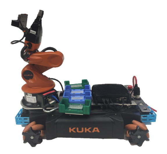
Fig. 1. Kuka youBot platform.