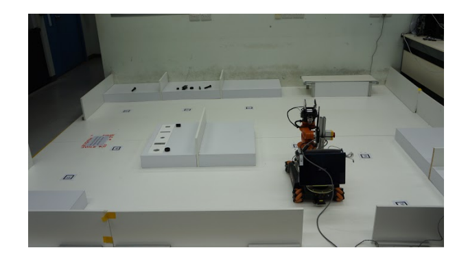
Fig. 2. Competition arena.