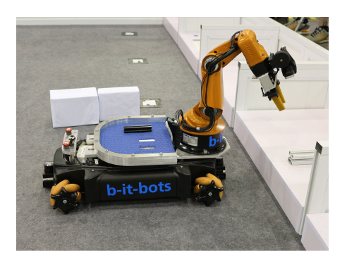
Fig. 1: b-it-bots robot configuration based on the KUKA youBot.

two Hokuyo URG-04LX laser range finders are mounted to support robust localization, navigation and precise placement of the omni-directional base. Each laser scanner is configured with an opening angle of 190° to reduce the blind spot area to the left and right of the robot. For perception-related tasks, a closerange RGB-D camera is mounted on the manipulator to the gripper palm. The Intel® RealSense F200 camera [1] supports a range from approximately 0.2 m up to 1.2 m and operates on 30 Hz for the RGB- and on 60 Hz for the depth stream. This sensor information is used for general perception tasks, such as: 3D scene segmentation, object detection, object recognition and visual servoing. The standard internal computer of the youBot has been replaced by one which has an Intel® Core i5 processor in order to perform the perception tasks; which are computationally intensive. Another custom modification has been made for the youBot gripper (based on the design of [3]) which enhances the opening range to 6.5 cm and enables grasping of a wider range of objects. The new gripper (see Figure 2) is actuated with two Dynamixel AX-12A servo motors which provide a position interface and force-feedback information. This information can be used to perform grasp verification. A final modification was performed on the back platform of the youBot. It has been replaced with a new light-weight aluminum version, the position of which can be manually adjusted forward and backward.