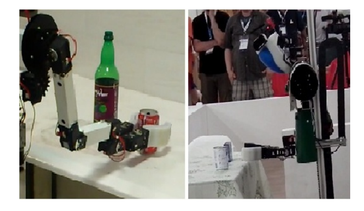
Fig. 4. Object recognition and grasping during the ARC lab tests and Robocup 2014 in Brazil.

In addition to improve this block we started working on MoveIt<sup>1</sup>. It provides an easy-to-use platform for developing advanced robotics applications and capabilities.