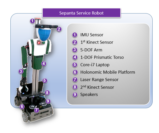
Fig. 1. Sepanta II equipment's description.

board. In low-level computations on this board, we drive the sensors such as infrared GP2D120 distance sensors, IMU data fusion and filtering, high level interfacing and data transfer, MD49<sup>1</sup> motor driver and wireless Robotis Controller pad interfacing. Also, we used two Intel core-i7 mini PCs instead of using laptops on the robot. Intel NUC and Gigabyte Brix mini PCs are preferred for their flexibility and reliability.