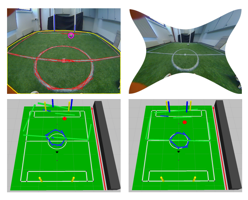
Fig. 2. Top: A captured image (left) with ball (pink circle), field line (red lines), field boundary (yellow lines), and goal post (blue lines) detections annotated, and the corresponding raw captured image with undistortion applied (right). Bottom: Projected ball, field line and goal post detections before (left) and after (right) kinematic calibration.