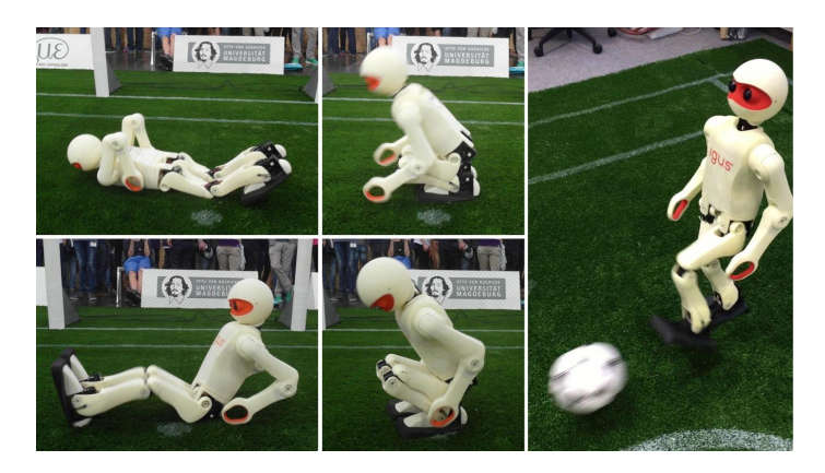
Fig. 3. Dynamic get-up motions, from the prone (top row) and supine (bottom row) lying positions, and a still image of the dynamic kick motion.

however, is a representation that was specifically developed for humanoid robots in the context of walking and balancing.