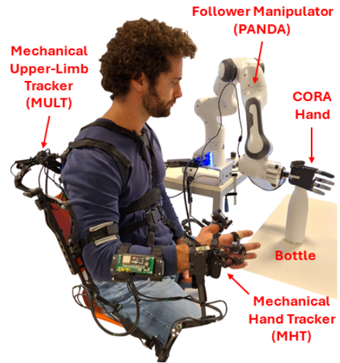
Fig. 2. Experimental setup arranged for a pick-and-place telemanipulation scenario.

As an initial functional evaluation, we created an experimental setup, illustrated in Fig. 2, to assess whether the MULT can effectively target the dorsum of the operator’s hand for telemanipulation tasks. In this scenario, the operator wears the MULT on their right arm, along with the Mechanical Hand Tracker (MHT) introduced in [8] (right hand). The MHT also serves as a fixed interface for the third branch of the MULT. In addition, MHT is provided by tactile feedback that, as largely discussed in our previous work, it’s enough for leading the users to conduct teleoperation tasks precisely, and a force feedback is not necessary. This reason allows to keep lightweight the device. The remote system (follower) is a commercial manipulator, specifically the 7-DoF Franka Emika Panda, arranged in a vertical configuration to emulate the human arm. The Panda’s end-effector is equipped with the CORA Hand [13].