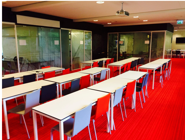
Fig. 2. The lecture room of Snellius at the Lorentz Center.

contribution potential, based on a short CV which highlights the participant's academic/industrial and technical skills. The idea is that the participants represent a synergic mix of junior and senior researchers, both from academia and industry. Moreover, to promote diversity, participation from all over the world is encouraged both in the selection process and by providing a partial travel support. At the end, the selected participants come from the Netherlands, Turkey, Italy, Tunisia, Austria, United Kingdom, Switzerland, Iran, Germany, Portugal, Peru, Malaysia, and Japan. The selected participants had experience in computer languages as C, C++, C#, R, Matlab, Java, Basic, Python, and Maple. They had experience with simulation environments as Unreal Engine, Gazebo, Player/Stage, Robotics Development Studio, Unit3D, V-rep, Open Dynamics Engine, and Bullet. They had participated in competitions as the DARPA Challenge, Japanese Virtual Robot Challenge, euRathlon, UAE Drones for Good, RoboCup Junior, RoboRace, Mid-size Sumo, and the RoboPoly challenges.