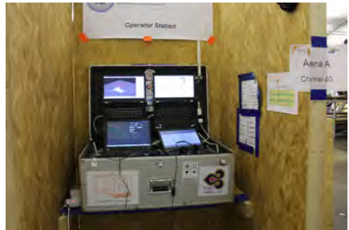
Fig. 9. The operator station

The speed of the set-up and break-down process of each task is very crucial. The team realizes that the faster for set-up and break-down, the better time for other tasks. The team uses aluminum case as the station. When needed, just open this aluminum case and turn on the switch. The operations can be started within 1 minute. Inside this aluminum case, there are three monitors, a notebook, an access point, a printer and a