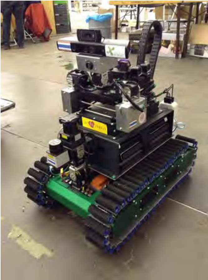
Fig. 2. Automatic robot locomotion