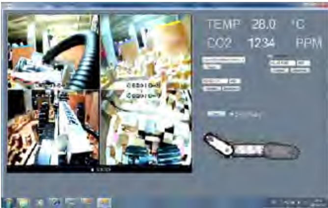
Fig. 8. Operator console illustrated the real time quad videos and the information of robots sensors.