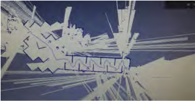
Fig. 6. Automatic map generated by iRAP ROBOT.