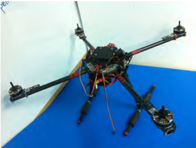
Fig. 3. Autonomous flying robot in outdoor mission, as quadrotor model.

are also installed into the aerial robot, such as temperature and camera sensor.