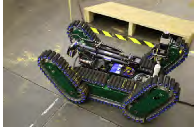
Fig. 1. Teleoperative robot locomotion

Y. Uaramorn and J. Sorndach are with the same University.