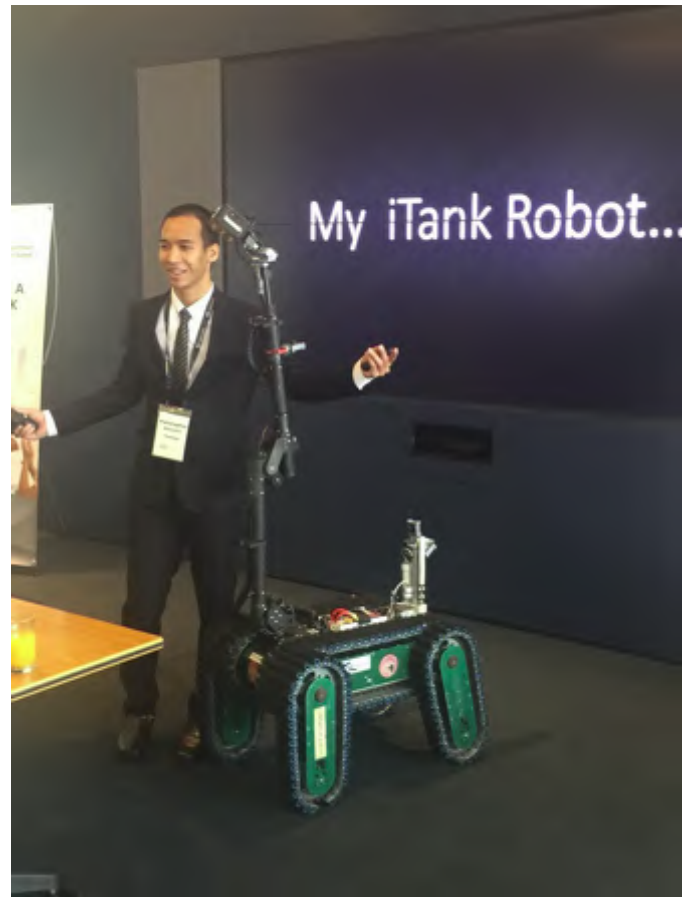
Fig. 5. The teleoperative robot is standing in doggy style to search to the victims.

Several kinds of sensors are installed on each robot to gain the data for processing and creating an automatically 2-D map on the operators computer monitor. The map is