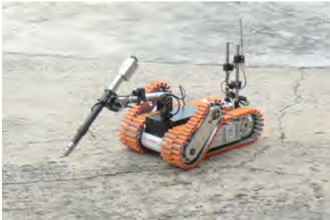
Fig. 10. The EOD (Explosive Ordnance Disposal) robot.

countries competitors, learned how to be a good team. The team gained many experiences. Importantly, the team knew that The great competition is not practicable, if you do not have a good teamwork.