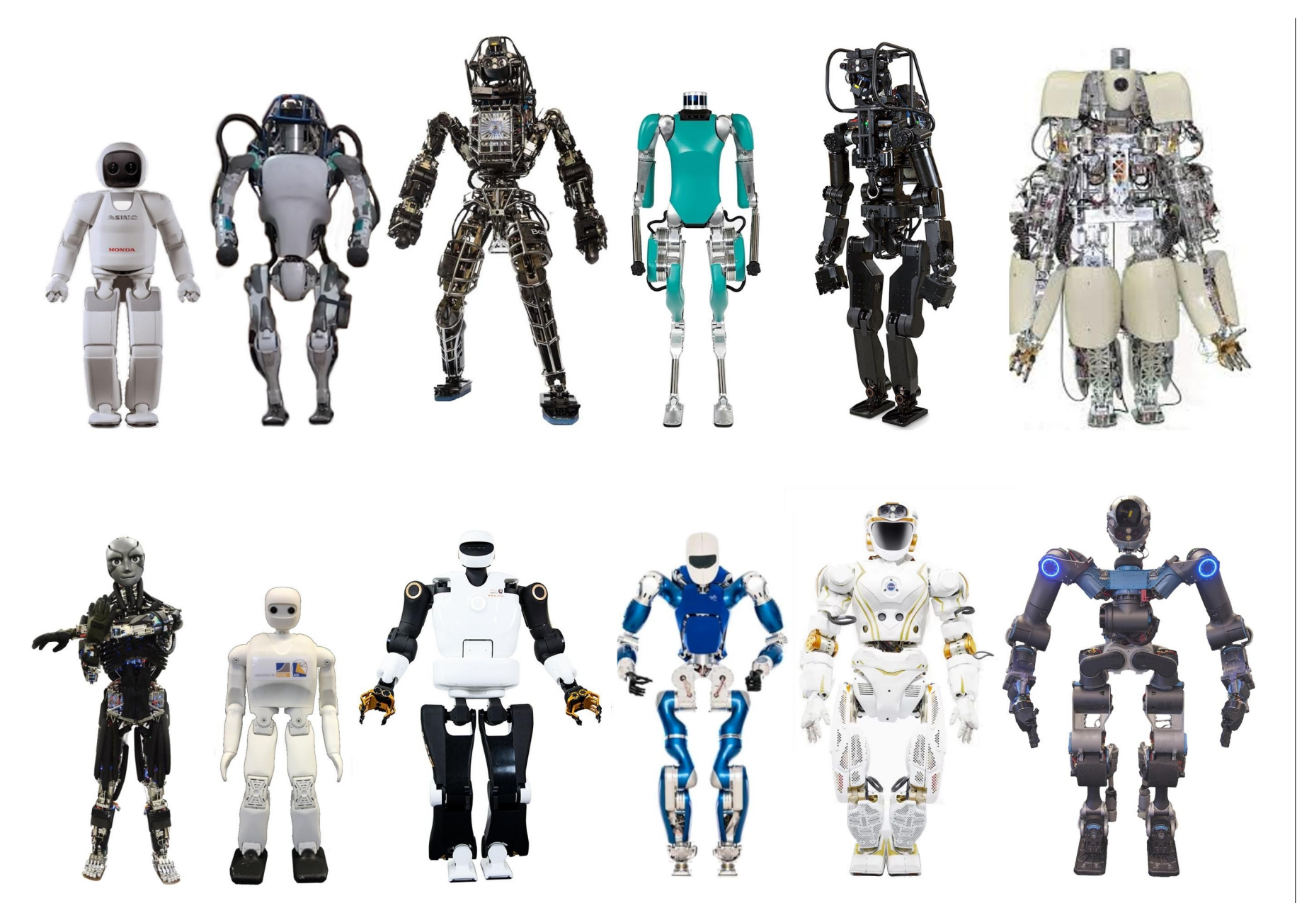
Fig. 1: Most recently developed bipedal humanoid robots with a full humanoid body plan, from left to right, top to bottom: Asimo, Atlas, Atlas-Unplugged, Digit, HRP-5P, Hydra, Kengoro, NimbRo-OP2X, TALOS, Toro, Valkyrie, WALK-MAN.