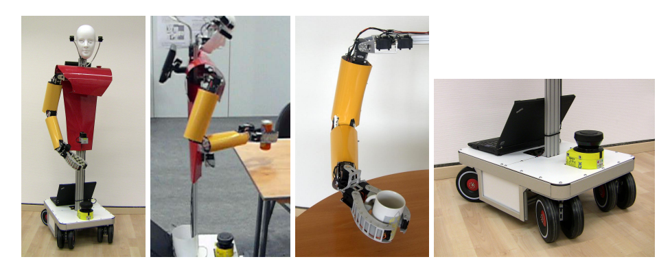
Fig. 2. Our robot Dynamaid with anthropomorphic arm and omnidirectional base.

For the use as communication robot, we equipped Robotinho with an expressive 15DOF head, visible in the right part of Fig. 1. The eyes are small (22\times26