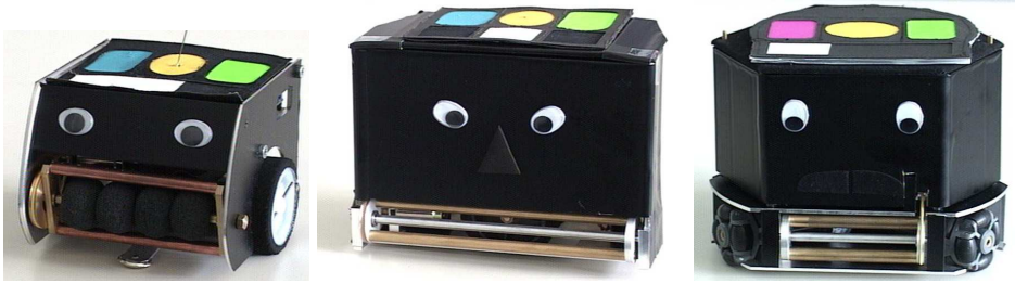
Fig. 1. Different robots designs. From left to right: classical two wheeled design, two wheeled defender, and robot with omnidirectional drive.

generated by them. Further, four servos can be steered and eight on/off switches can be used. A mezzanine board contains a radio transceiver SE200 working in the 433MHz band that can be tuned to 15 channels in 100kHz steps.